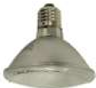
Bulb for Cabinet Interior