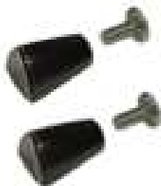
Knobs with Tee Bolts (for Popper Doors)