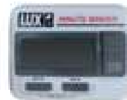
LCD Resettable Timer (Velcro tabs included for mounting)