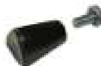
Knob with Screw (for Old Maid Pan)