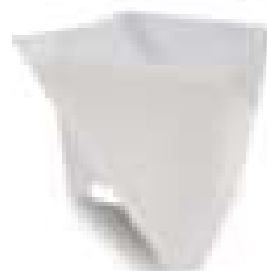
6 oz. Measure